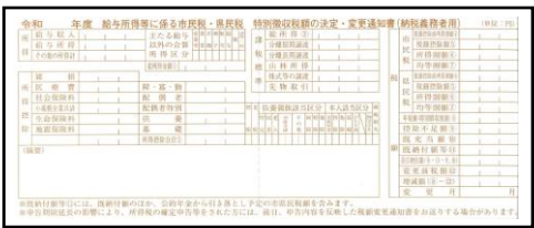
This form is sent to your employer

Individuals who receive a Tax Notice must pay residence tax.