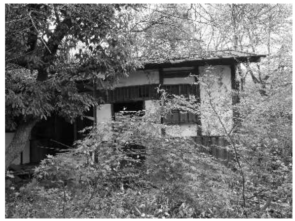
Cultural Village in Arima-chō, Kita Ward, Kobe City

According to the Kobe Shimbun of December 18, 1941, there were still over 90 Jews residing in Kobe after the send-off of the refugees. Diplomats of the Axis powers and civilians, including other foreigners residing in Japan, were relocated to areas such as Karuizawa for safety after 1943. The Jews remaining in Kobe were evacuated before the beginning of the intensive air raids by the U.S. forces. Between March and April of 1945, they moved to a cultural village northeast of Arima Onsen (Arima Hot Spring) in Kita Ward, Kobe City.