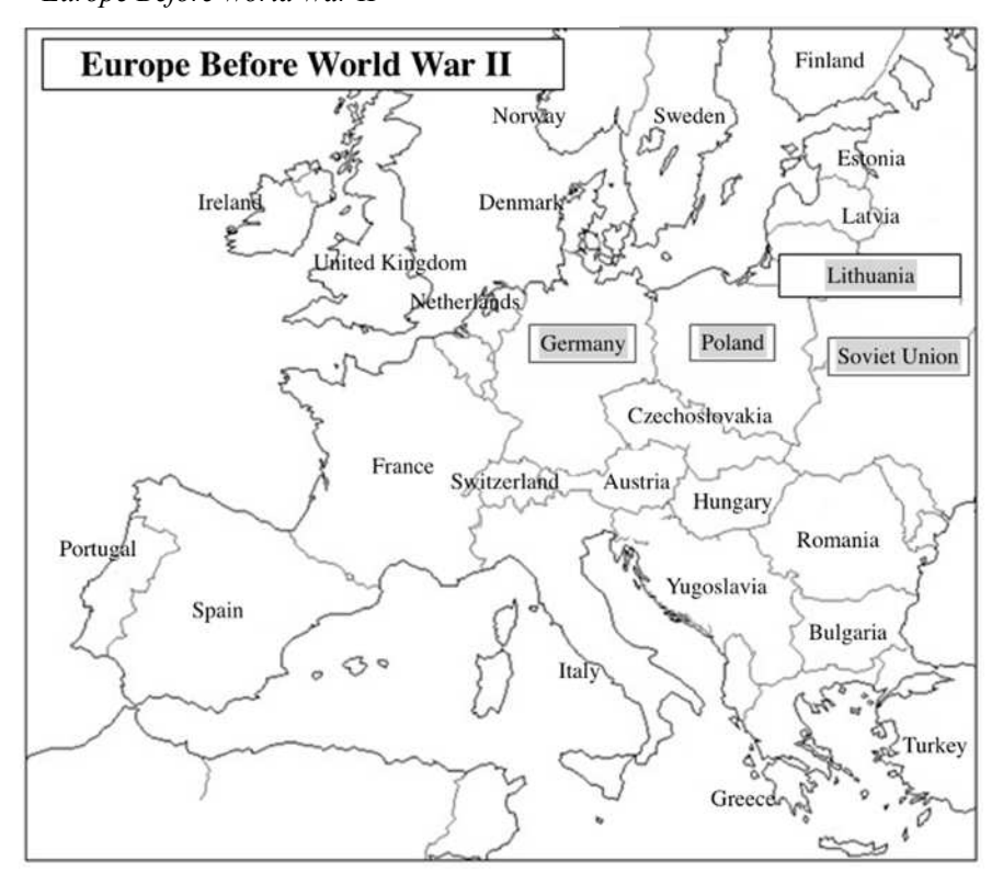
Figure 1 Europe Before World War II

On September 1, 1939, Germany invaded Poland, marking the beginning of World War II. The influx of Jewish refugees to Japan from Europe is attributed to this event. When Hitler came to power in 1933, anti-Semitic activities such as boycotts of Jewish businesses were implemented throughout Germany. In September 1935, the Nuremberg Laws were enacted, which relegated Jews to second-class citizenship and stripped them of their political and public rights. These laws defined Jews as anyone with three or four Jewish grandparents, including Catholics, Protestants, or those who became nuns after converting from Judaism. In November 1938, an event known as Kristallnacht, or the Night of Broken Glass, triggered a nation-wide pogrom in Germany, during which 91 Jews were killed, and over 30,000 were arrested and detained in concentration camps.