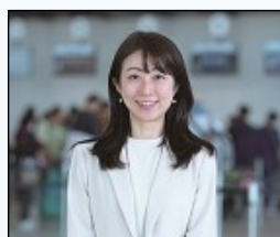
(Port and Harbor Bureau staff)

"I am responsible for the management of sewage treatment plants, including construction design and maintenance work."