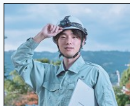
(Public Construction Projects Bureau staff)

"I work to make Kobe a city resilient to disasters. Every day, I strive to prevent problems during emergencies."