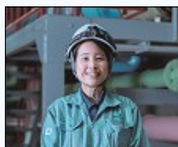
(Public Construction Projects Bureau staff)

"I work to make Kobe a city resilient to disasters. Every day, I strive to prevent problems during emergencies."