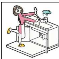
Faucet water leak