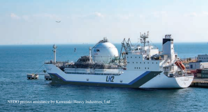
NEDO project assistance by Kawasaki Heavy Industries, Ltd.