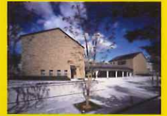
Kobe City Koiso Memorial Museum of Art