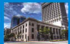
Kobe City Museum