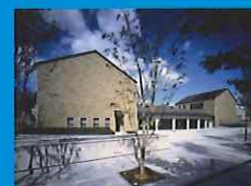
Kobe City Koiso Memorial Museum of Art